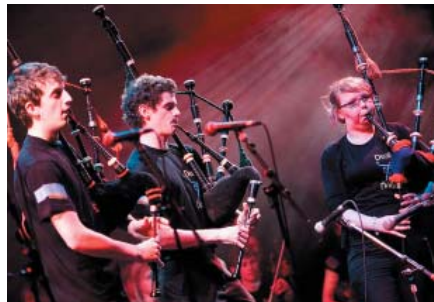
Highland 2007 Showcase Eden Court, January 2008