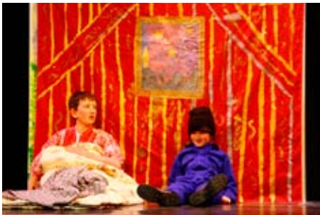
Appin An Tractar

Airson a' chiad uair bhon a chaidh a stèidheachadh ceithir bliadhna air ais, chaidh Fèis Dràma Sgoiltean Gàidhlig Earra-Ghàidheil a cumail tron latha aig Talla a' Chorrain san Òban. Bha sia dealbhan-cluiche ann uile gu lèir bho sgoiltean cho fada tuath ri Malaig agus cho fada deas ri Dun Omhain.