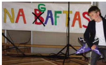
Sandbank Primary, Dunoon

The Argyll drama Fèis has become a very popular event and has grown over the past five years. All the schools involved look forward to travelling to the event and some manage to combine it with a bit of retail therapy, visiting shops and going bowling or to the cinema and meeting all the other schools. Some long lasting friendships have been formed over these past few years - a welcome spin-off in the world of Gaelic school activities.