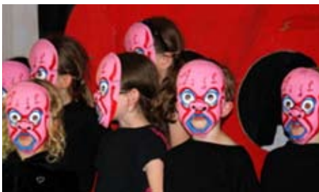
Mallaig Primary School (Juniors)

This year's Argyll Drama Fèis was held in the new community school in Acharacle.