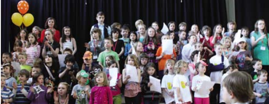
(Fèis Ghlaschu)

Feumar a ràdh gun robh an ìre de Ghàidhlig a bha ri cluinntinn uabhasach àrd agus gun robh oidhirp agus tlachd a h-uile duine san tachartas, agus na bha e a' ciallachadh riutha, furasta fhaicinn.